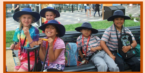
On the way and arrival at Circular Key!