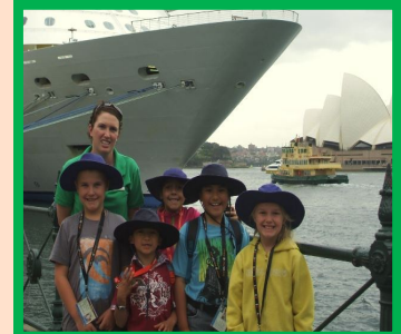
In our room, on the ferry, sites of Sydney and Harrison's Pharmacy at The Rocks!