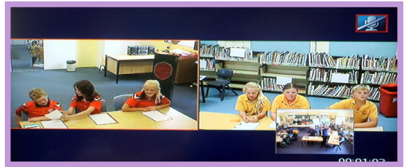
Mumbil Public School

On Thursday Sofala Public School and Mumbil Public School met in the Grand Final of the 2014 'Small Talk' Debating Competition. Their topic was "Humans Should Colonise Mars" What a debate! All the students who have participated in the 'Small Talk' Competition should feel proud of their achievement. It has been wonderful to watch you all progress during the competition.